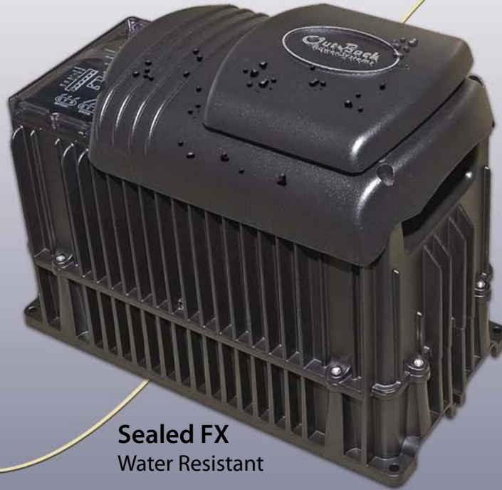
Sealed FX Water Resistant